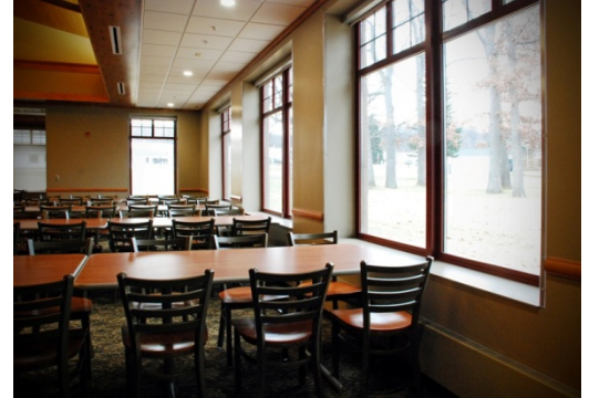
Camp Grayling Dining Hall