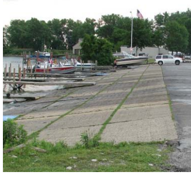
Harley Ensign Boat Access Site