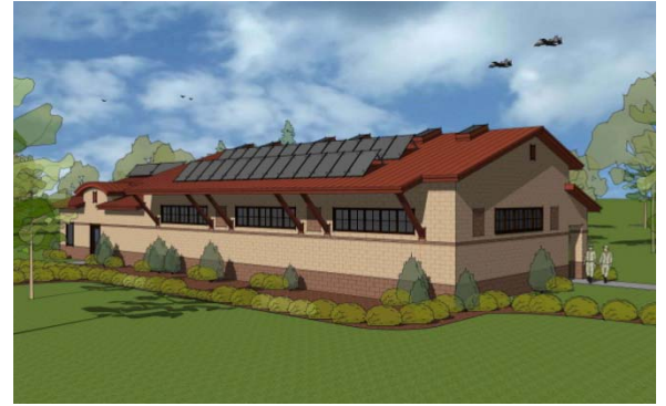
Classroom Facility 116-120