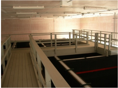
Camp Grayling Live Fire Shoot House