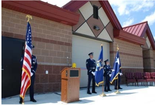
Squadron Operations Facility Grand Opening Ceremony