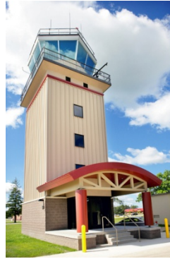
Air Traffic Control Tower